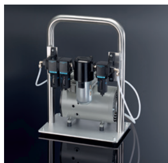
External pump with filter and air dryer unit for pressure and vacuum