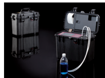
Rugged case PAMAS GO for harsh environments

PAMAS HEAD OFFICE Dieselstraße 10, D-71277 Rutesheim, Phone: +49 7152 99 63 0, Fax: +49 7152 99 63-32, Email: info@pamas.de